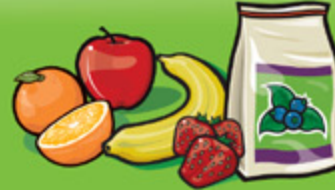
Fresh, frozen or canned fruits 1 fruit or 125 mL (½ cup)