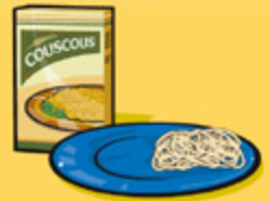
Cooked pasta or couscous 125 mL (½ cup)