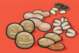
Shelled nuts and seeds 60 mL (¼ cup)