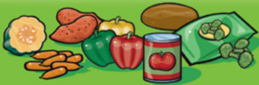
Fresh, frozen or canned vegetables 125 mL (½ cup)