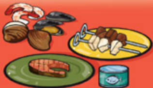
Cooked fish, shellfish, poultry, lean meat 75 g (2 ½ oz.)/125 mL (½ cup)