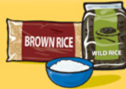
Cooked rice, bulgur or quinoa 125 mL (½ cup)