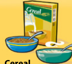
Cereal Cold: 30 g Hot: 175 mL (¾ cup)