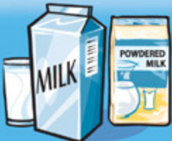
Milk or powdered milk (reconstituted) 250 mL (1 cup)