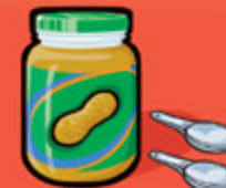
Peanut or nut butters 30 mL (2 Tbsp)